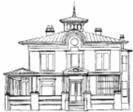
Jerome Powel House 1865