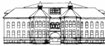
Old Central School 1900