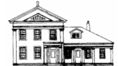
George Dickinson House 1855