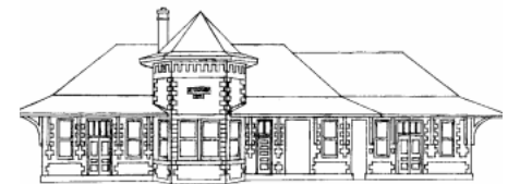
B&O Rail Station 1905