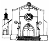
St. Leo's Catholic Church 1941