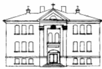
St. Leo's School 1904