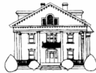
W.E. Hall House 1904