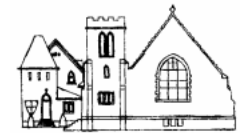
Grace Episcopal Church 1904