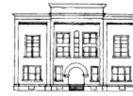
The Amroy 1904