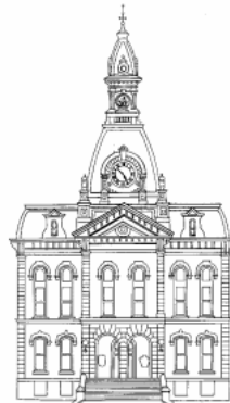
Elk County Court House 1880