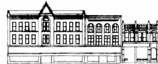
Grand Central "Smith Brothers Department Store" 1882