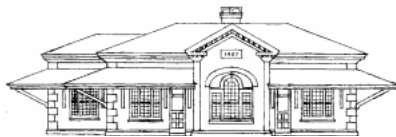
Pennsylvania Rail Station 1907