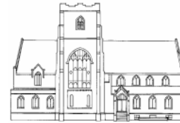
Presbyterian Church 106 E. Union St. Built circa 1904