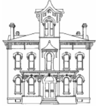
The Winslow Mansion 200 Pine St. Built circa 1868