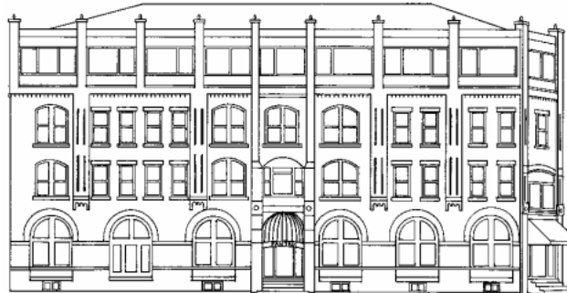
The Pantall Hotel Corner S. Jefferson & E. Mahoning St. Built circa 1888