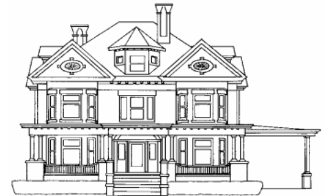
The Kurtz/Vancheri Mansion 312 W. Mahoning St. Built circa 1904-1906