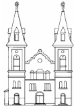
Byzantine Catholic Church 714 Second Ave. Built circa 1904