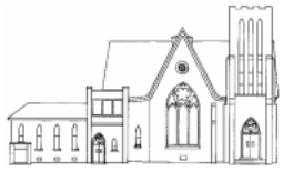
First United Methodist Church W. Mahoning & Church St. Built circa 1899