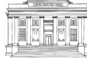
Old United States Post Office Corner Pine and N. Findley St. Built circa 1914