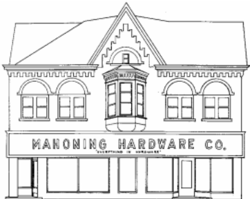
Mahoning Hardware Building Corner S. Gilpin & W. Mahoning St. Built circa 1893