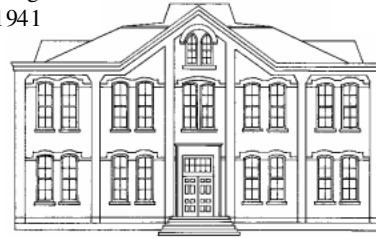
Old West End School (IUP Punxsy) 1010 Winslow Ave. Built circa 1891