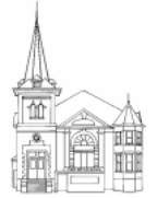
First Baptist Church 209 E. Union St. Built circa 1904