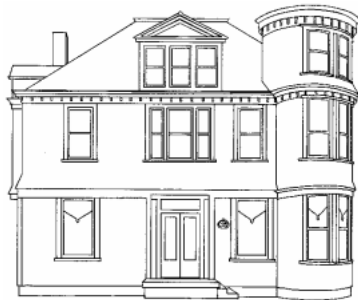
The Morrison/Brown/Hughes House 109 Church St. Built circa 1880's