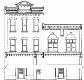
This & That Building 123 E. Mahoning St. Built circa 1890