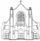
SSCD Church 616 W. Mahoning St. Built circa 1941