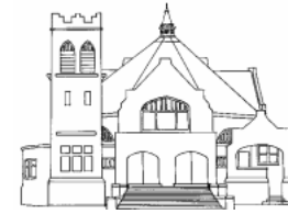
First United Methodist Church 1909 301 N. Jefferson St.