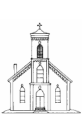
St. John's Lutheran Church 1867 220 N. Jefferson St.