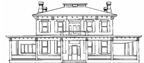
Truby-Greenbaum-Gavran House 1854 280 N. Water St.