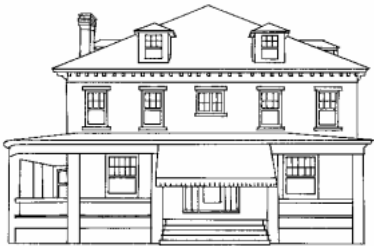
The Inn On Vine 1907 241 Vine St.