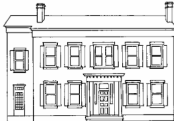
Patterson-Sedwick House 1853 216 N. Jefferson St.