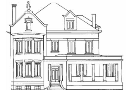
Meredith-Clayland House 1904-1905 138 N. Water St.