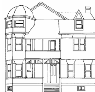
Campbell House 1885 Corner N. Water and Market St.