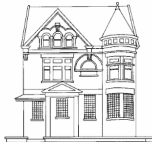
Fox-McCullough House 1890 108 S. Water St.