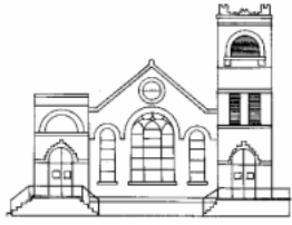
St. Luke's United Church of Christ 1900 333 N. McKean St.