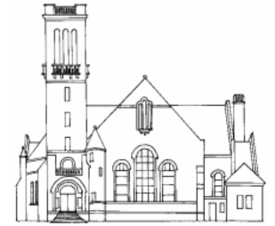
Grace Presbyterian Church 1890 Rebuilt 1910 Corner Arch and N. Jefferson St.