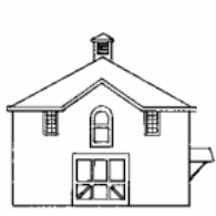
McCain House 1842 (Armstrong County Historical Museum) 300 N. McKean St.