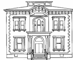
Colwell House (The Old Library) 1860 200 N. Jefferson St.