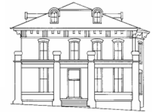
Gov. Curtin Residence Built 1868 120 W. High St.