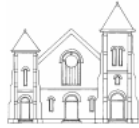
Presbyterian Church Built 1870 Spring St. at Howard St.