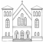
St. John's Roman Catholic Church Built 1884 100 East Bishop St.