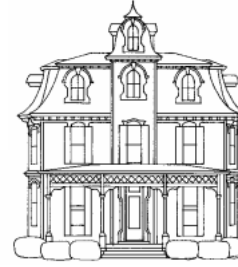
Ardell-Neff Residence Built 1880 313 E. Linn St.