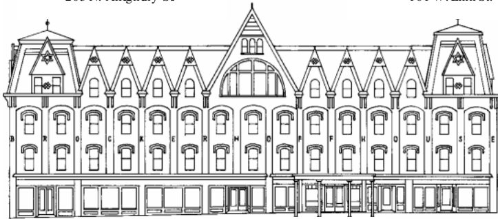
Brockerhoff Hotel Built 1866 Allegheny and High St.