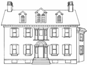
Miles-Potter-Humes Residence Built 1814-1816 203 N. Allegheny St.