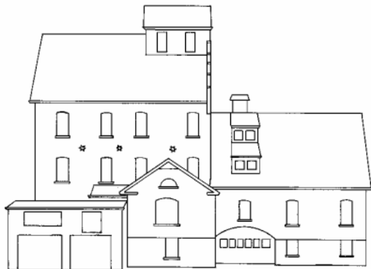
Gamble Mill Built circa 1894 Dunlap and Lamb St.