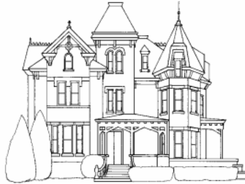
Reynolds Mansion Built 1883-1884 101 W. Linn St.