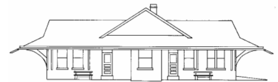
Pennsylvania Railroad Station Built 1888-1889 S. Potter and W. High St.