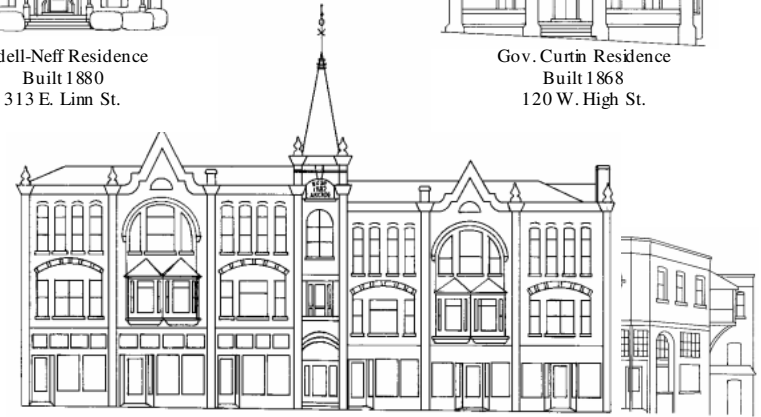
Bush Arcade Built 1887 200 Block W. High St.